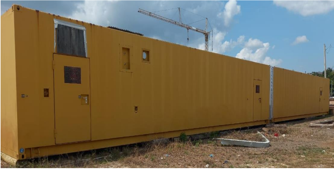
Figure 3: Containerized Caterpillar CG170-20 Genset at Storage Location.