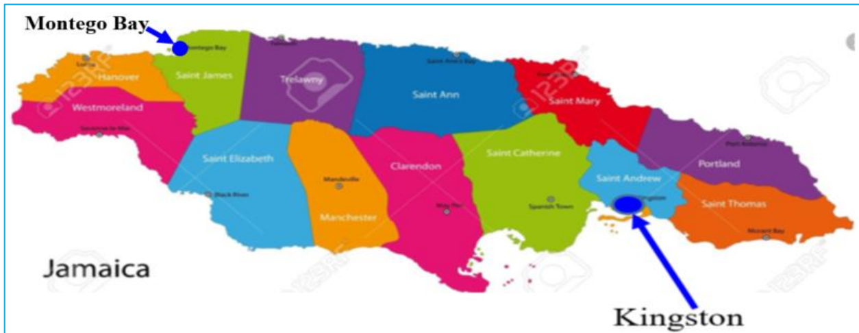
Figure 1: Location of Gas Turbines

The plants containing the units referred within this RFP consist of Gas Turbines at the Hunts Bay and Bogue Power Plants in Kingston and Montego Bay respectively. Hunts Bay: (GT#5 and GT#10) and at Bogue Power Plant (GT3, GT6, GT7, GT9), totaling 131.5 MW. JPS is currently in the development phase of a 171.5MW power facility to replace assets that will be due for retirement within the next 4 years (2026/27). There are also, 2 x 2 MW, CG170-20 Caterpillar, twenty (20) Cylinders, Natural Gas, Internal Combustion Engines (“Gensets”) that are available for sale now.